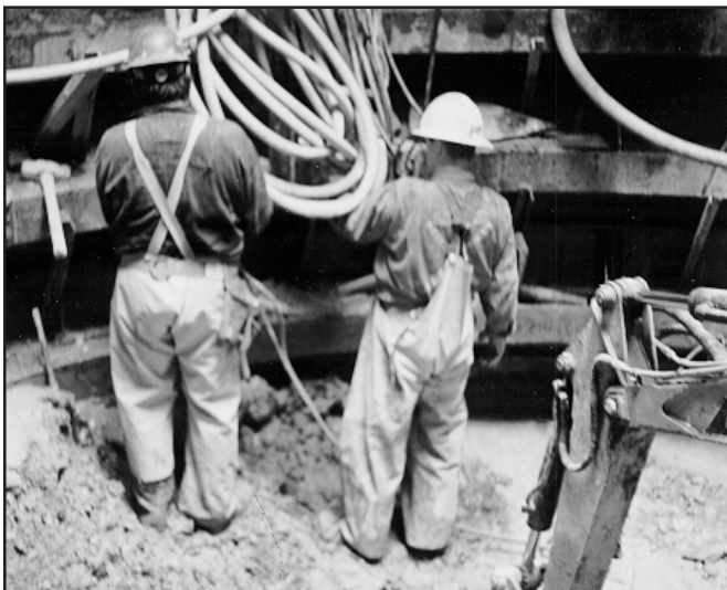
Miners preparing for polyurethane injection to stop inflows of quicksand into a 24 foot diameter shaft collar excavation

Project personnel are instructed in the fundamentals of grouting operations and are trained in the proper selection and use of grouting materials and equipment. Mine grouting projects are usually unique in one way or another, which requires specific training for site conditions. Monitoring and evaluating quality control of grouting materials is an important aspect of our training activities.